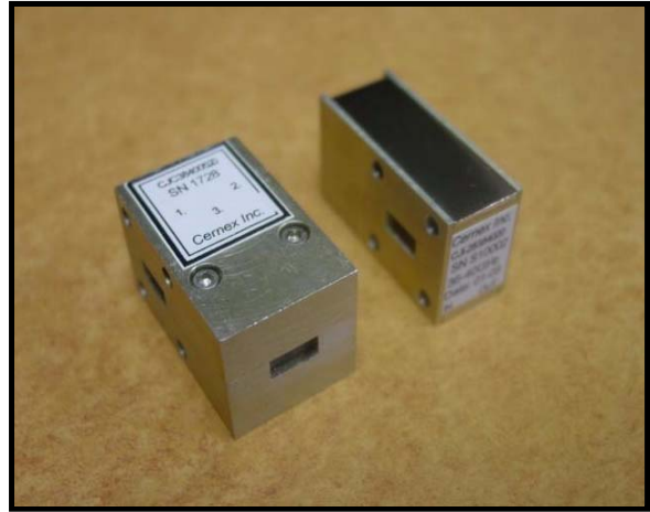
CJI & CJC Series