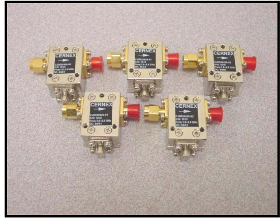
COI & COC Series