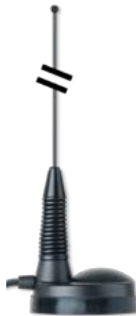
GPSDS13780GR with Magnetic Base and Boot Option

*Add .625" overall height for all P mount models