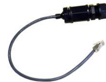
Patent Pending Field Replaceable RJ45 Ethernet Feedthru